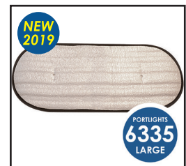
Portlights – large