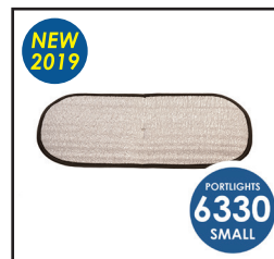
Portlights – small