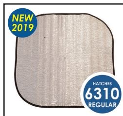
Hatches – regular