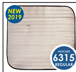
Hatches – large