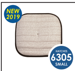
Hatches – small